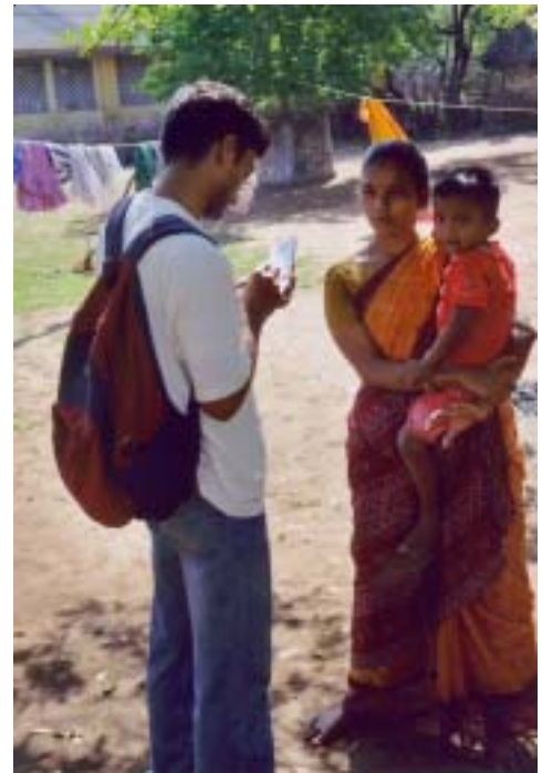
Med Student Interviews Woman from village hit by Tsunami

To address the core problem of economic disruption and the need to diversify livelihoods, CMC is drawing on its extensive experience in community development work to initiate the following activities: a computer training center, training in six trades, an endowment to assist girl children until they marry, assistance to local orphanages, and construction of a community hall that will facilitate training and other social interaction.