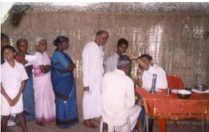
CMC Doctor treating villagers