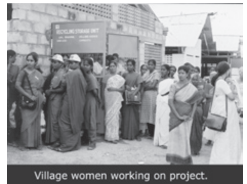
Village women working on project.