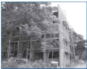
B asic Sciences Laboratory going up.

The high dose rate brachytherapy unit and accompanying anesthesia equipment modules and cardiac defibrillator were scheduled for delivery in August.