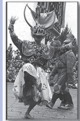
Dancer at Festival