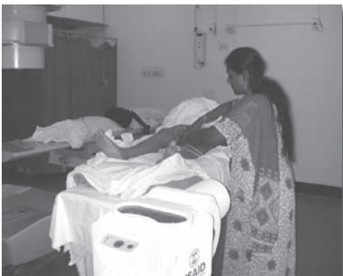
Patient treated by Brachytherapy machine

The past few months have seen the installation of two important pieces of infrastructure at CMC, funded by the American Schools and Hospitals Abroad Program of the United States government. After a long period of planning and construction, a pneumatic delivery system for clinical samples has been installed and is working smoothly. The system, which consists of capsules propelled through tubes driven by air pressure, allows a blood sample to be sent from clinic to lab in a few seconds. Previously, such samples had to be hand-delivered by orderlies threading their way through the crowds of patients and staff. Given the fact that over 4,000 people are seeking medical attention each day at the main hospital, the amount of time saved is a great efficiency.